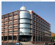
Tay House, Glasgow