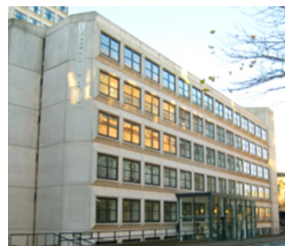
Venlaw, 349 Bath St, Glasgow

Our head office is relocating to the Venlaw Building on Bath Street, Glasgow. The move supports our ongoing commitment to maximising the efficiency of our administration and delivering our clients and staff with the highest standard of service. The central location has great public transport links that will allow easy access to the head office and its training facility.